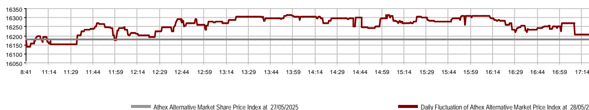
Daily Fluctuation of Athex Alternative Market Price Index