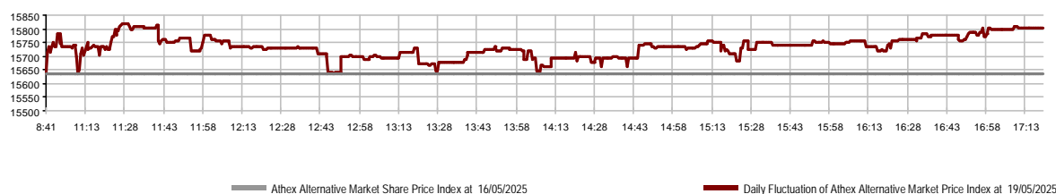
Daily Fluctuation of Athex Alternative Market Price Index