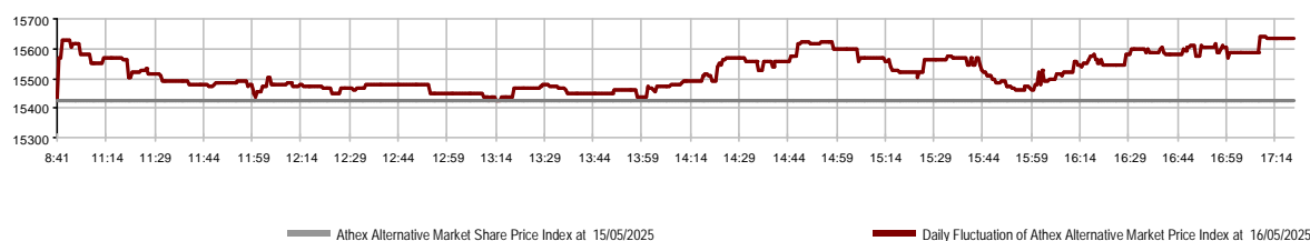
Daily Fluctuation of Athex Alternative Market Price Index