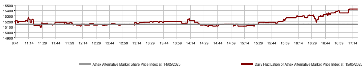
Daily Fluctuation of Athex Alternative Market Price Index