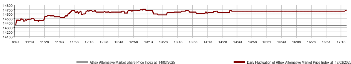
Daily Fluctuation of Athex Alternative Market Price Index