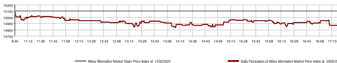
Daily Fluctuation of Athex Alternative Market Price Index