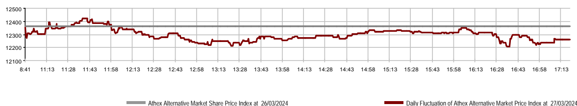
Daily Fluctuation of Athex Alternative Market Price Index