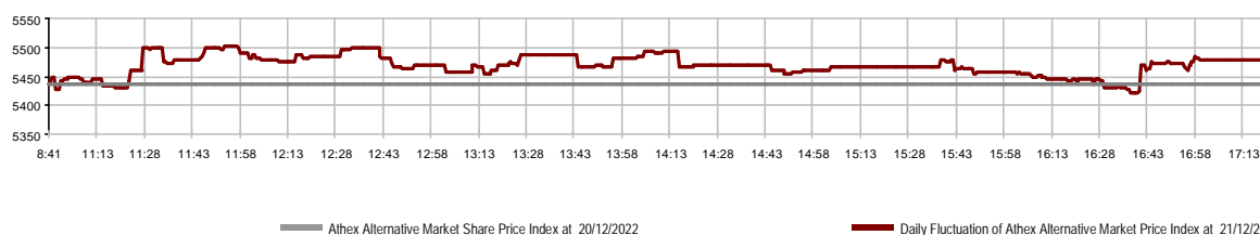
Daily Fluctuation of Athex Alternative Market Price Index