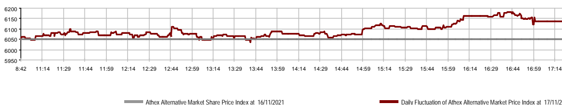
Daily Fluctuation of Athex Alternative Market Price Index