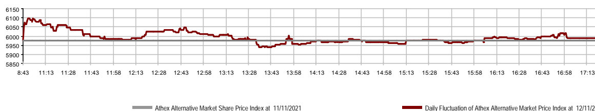
Daily Fluctuation of Athex Alternative Market Price Index