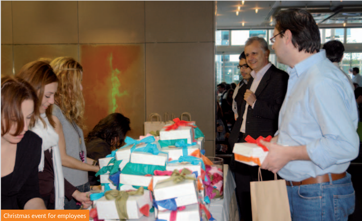
Christmas event for employees