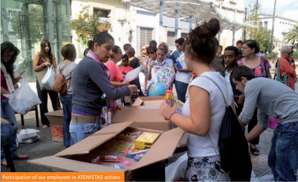
Participation of our employees in ATENISTAS actions