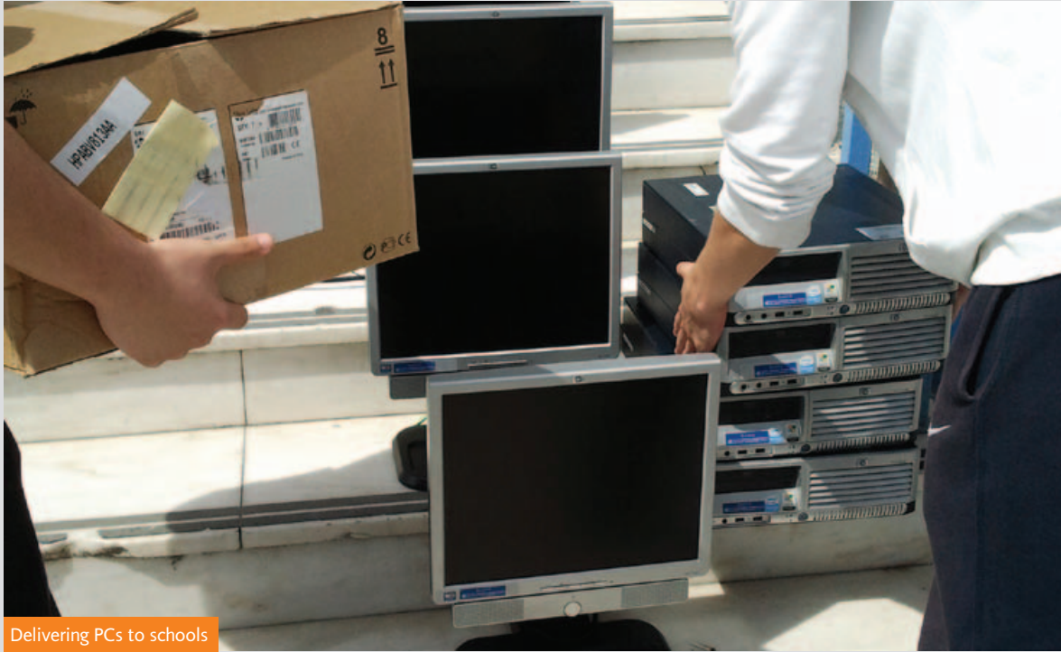
Delivering PCs to schools