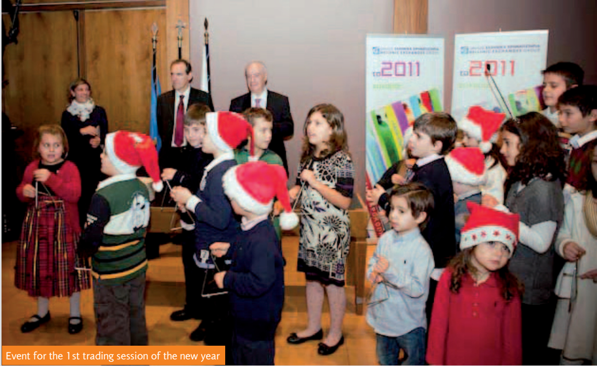
Event for the 1st trading session of the new year