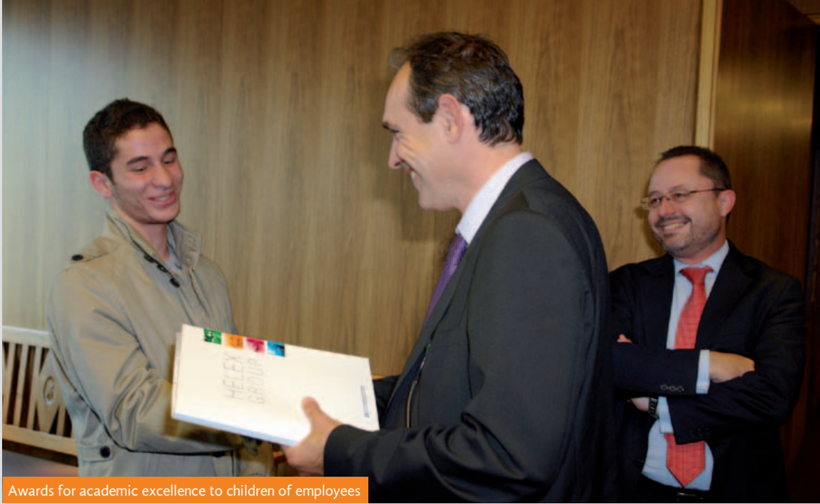
Awards for academic excellence to children of employees