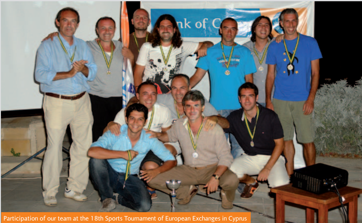
Participation of our team at the 18th Sports Tournament of European Exchanges in Cyprus